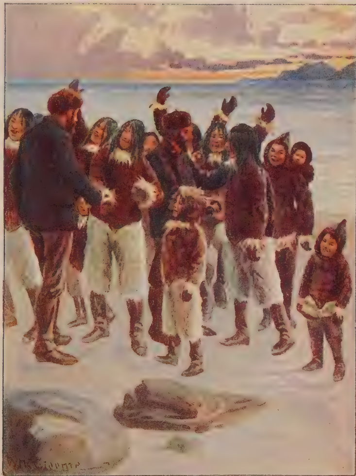
“They danced and jumped, and tossed up their arms and legs.”